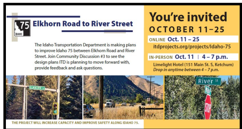
A postcard was sent to the community.