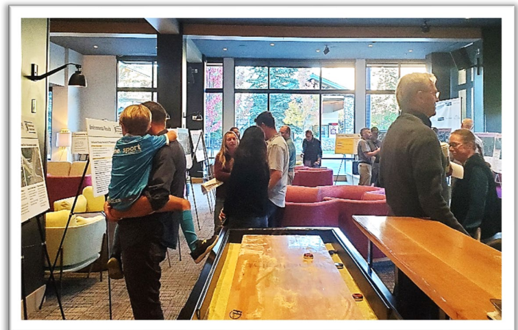
Community members discuss project at in-person meeting.

Community members were invited to attend an in-person meeting at the Limelight Hotel in Ketchum on Tuesday, October 11. Attendees were greeted at the sign-in table and directed to the display boards. Design plans, environmental maps and other information was placed around the room for attendees to review. ITD and other staff members were on hand to discuss design plans and answer